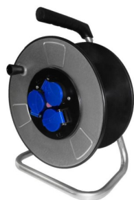
EM050 - EM50P