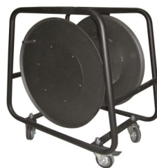
EM100 - EM 100R